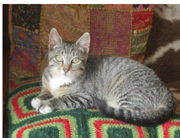
(Photo – Rocky went home with a lovely family in Arthurs Point on adoption day)

Where does the purr come from? Purring originates in the vocal chords. The sound is produced as the chords vibrate, as they are rapidly pulled to and fro by the muscles in the walls of the larynx (or voice box). These muscles are, in turn, controlled by nerves that set the rhythm of the purr. We associate purring with pleasure, but cats may also purr after being involved in traffic accidents or when frightened, such as when they are at the veterinary surgery. (from 'Cats' by Dr Bruce Fogle)